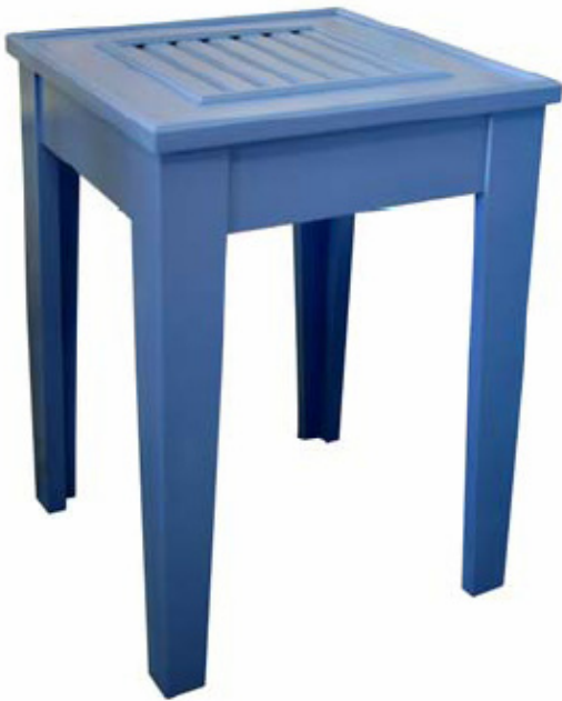
Item # 251 Bermuda End Table