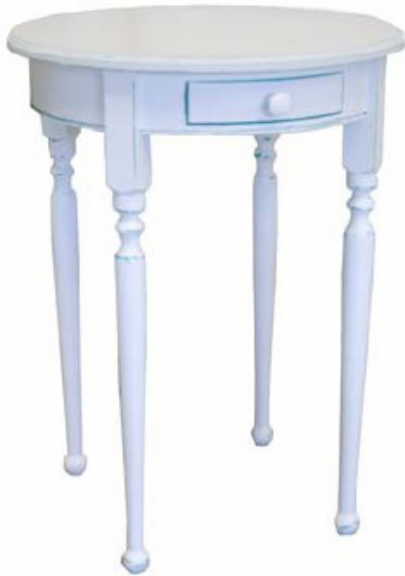
Item # 32HC Concord Side Table