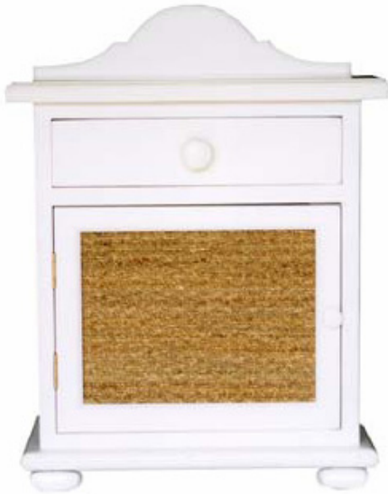
Item # 509 Seagrass Nightstand