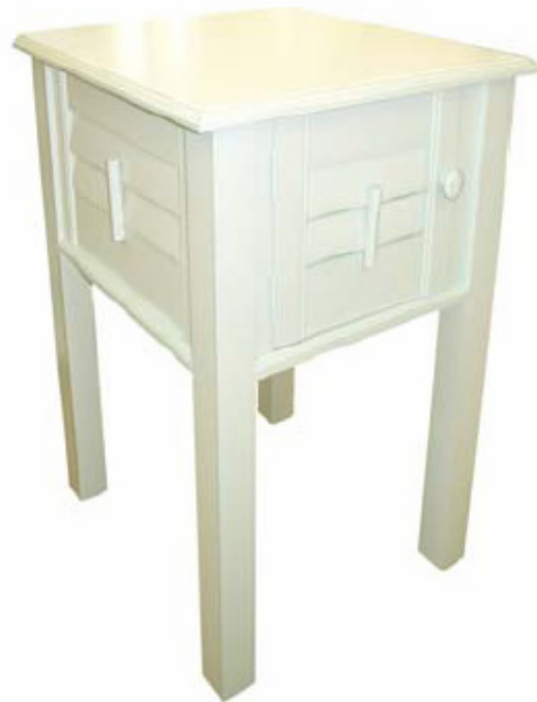
Item # 417 Tide Side Table