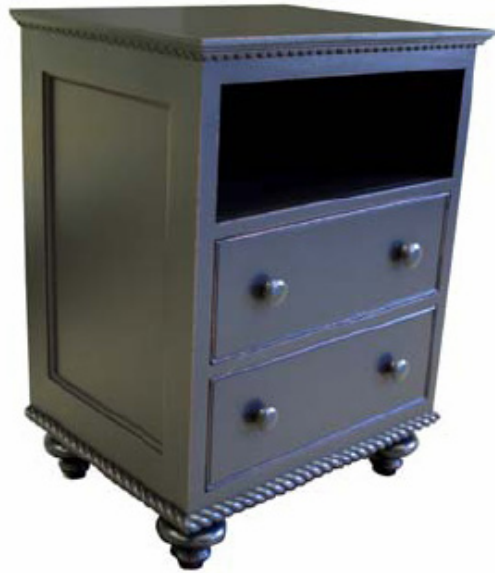
Item # 535 Open Nightstand