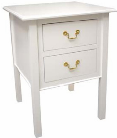
Item # 130 Side Table